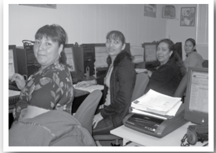
PowerPoint is fun