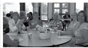
Volunteer teacher's gathering