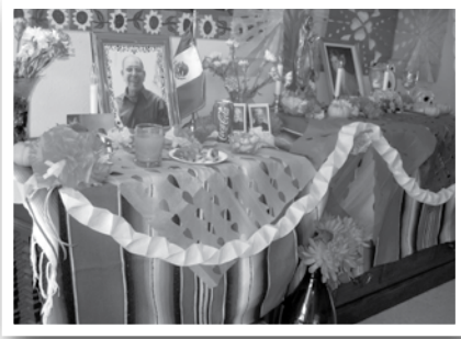
Day of the dead altar