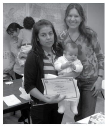
Weekly nutrition classes