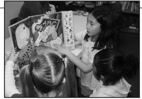
Second Graders from the Charter School reading and singing to our children.

families) – Diocese of San Jose Retired Teachers – San Jose Mercury – Morgan Hill Charter School’s Second Grade donating eight hundred books for families and visiting and reading to the children – Our Special Event Committee – Asians for a Better Community.