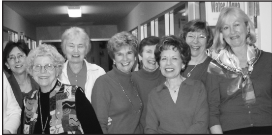
Diocese of San Jose Retired Teachers, hostesses of the 2007 Valentine Tea for all our students